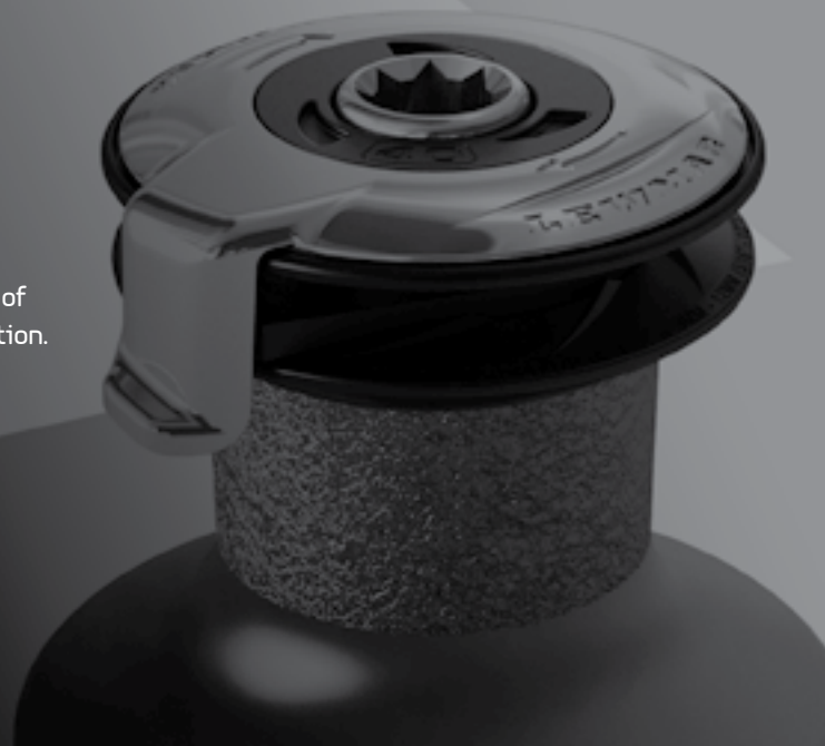
Dimensions Diagram EVO® Self-Tailing Winch